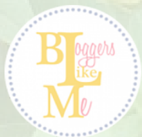
Bloggers Like Me